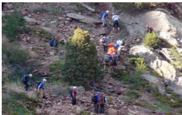
Scree lowering patient in litter (orange, middle) click to enlarge

Approximately ten RMRG rescuers and ten personnel from other agencies were in position at the base of Redgarden Wall below the accident site. Some of these rescuers worked in support roles for the mid-wall activities, managing ropes and gear from the ground. Others prepared the scree evacuation route. The entire route was scouted for potential hazards, and multiple belay (lowering) stations were pre-set. Additional rescuers were in position down-slope anticipating the possibility of relieving litter bearers during the scree evacuation.