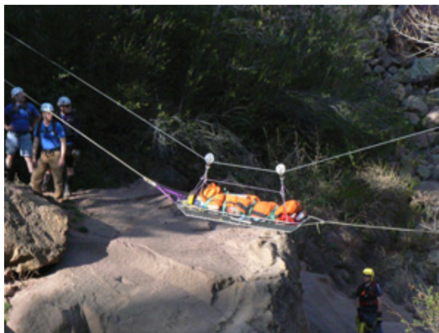
Lifting litter-borne patient across the creek with a wire Tyrolean traverse - click to enlarge

another team of rescuers built a Tyrolean ("Tyrol") traverse system to lift the patient across South Boulder Creek. RMRG chose to use the Tyrolean crossing for several reasons. Because the creek was high, litter bearers wading with the litter was not an option. That left a choice between carrying the patient along the Streamside Trail to the footbridge, or using the Tyrol. In most cases when RMRG evacuates a litter-borne patient from the western portion of the Redgarden Wall, the Tyrol is significantly faster, safer, and more comfortable for the patient. For more on this, please see FAQ6 on our Operational FAQ page.