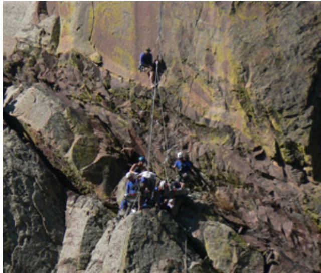
Rescuers loading patient into litter before vertical evacuation click to enlarge

However, for a patient located in the middle of a cliff, the best access route might be from above, below, or traversing from the same elevation. It may be fastest to send medical personnel with light loads up from the ground while other rescuers carry the heavier evacuation gear (litter, full-body vacuum splint , 400-1600 feet of rope, anchor and brake equipment, additional oxygen, etc.) around to an easier access route from the top (potentially via the East Slabs descent route). We are quite familiar with using both approaches on various portions of Redgarden Wall. However, the Redgarden Wall is a big formation and small changes in the location of the injured party can drastically effect rescue access and the evacuation route. Therefore, we generally investigate and fix lines for all options until the best solution can be determined.